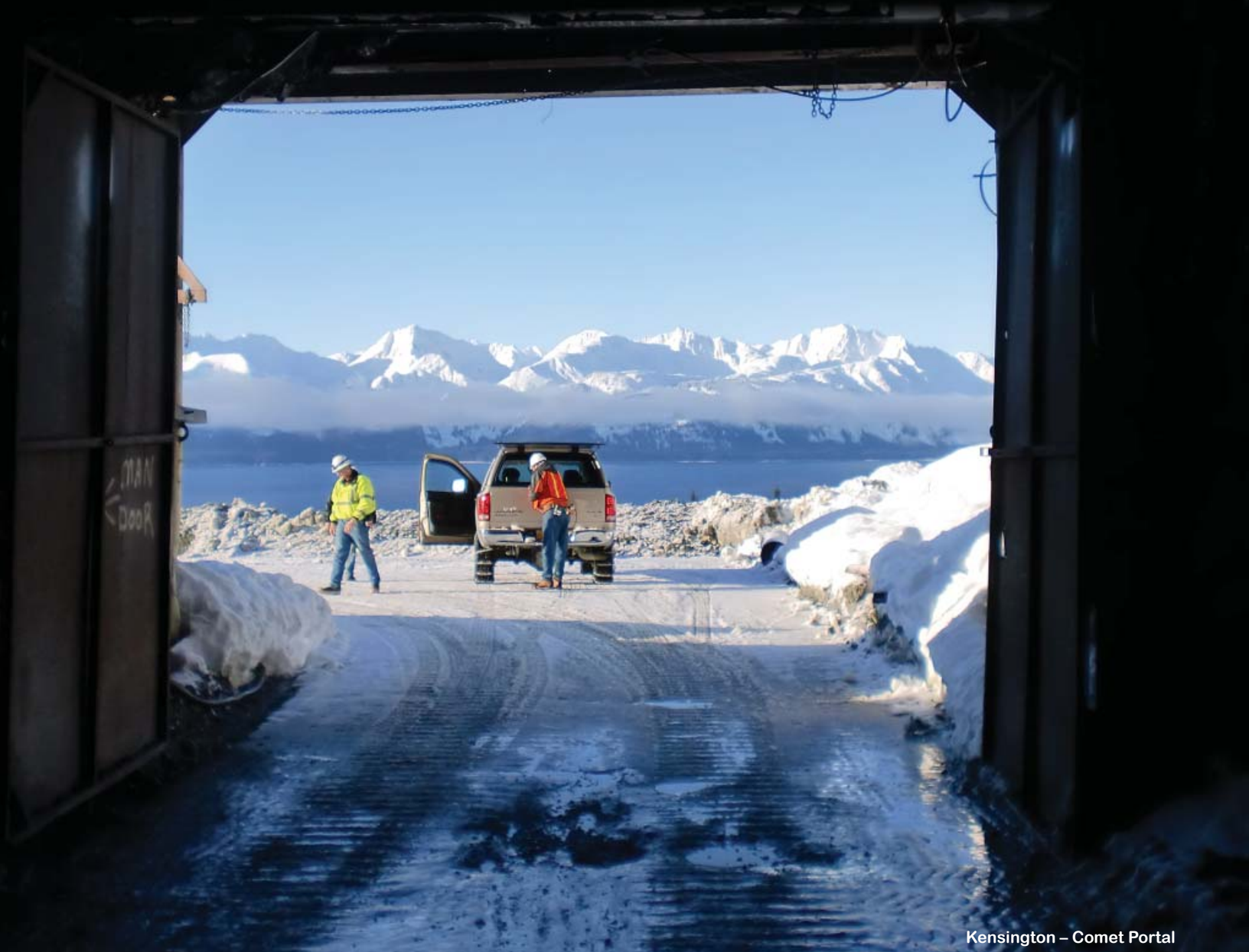
Kensington – Comet Portal

The Alaska Minerals Commission (Commission) serves in an advisory capacity to the Governor and the Alaska State Legislature (Legislature). Its role is to recommend ways to mitigate constraints on mineral development in Alaska. This annual report fulfills that mandate.